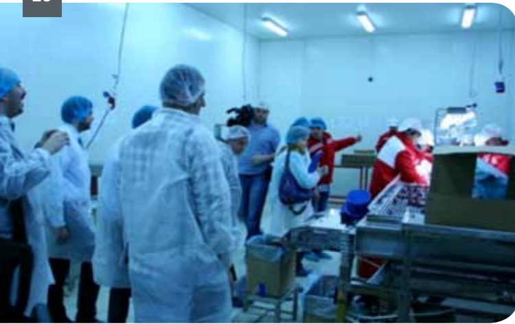
Visiting the freeze-drying room for raspberries at Drenovac Fruit Processing Company, Arilje