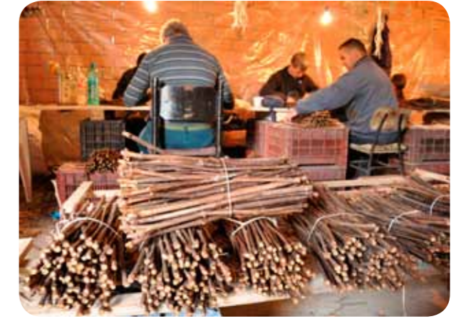
Skilled workers from Serbia producing vine grafts at company Agrokaletm, Timjanik

is a widespread need among farmers to diversify their products, and where possible to add value to them in order to get a fair income and gain competitiveness through cooperation.