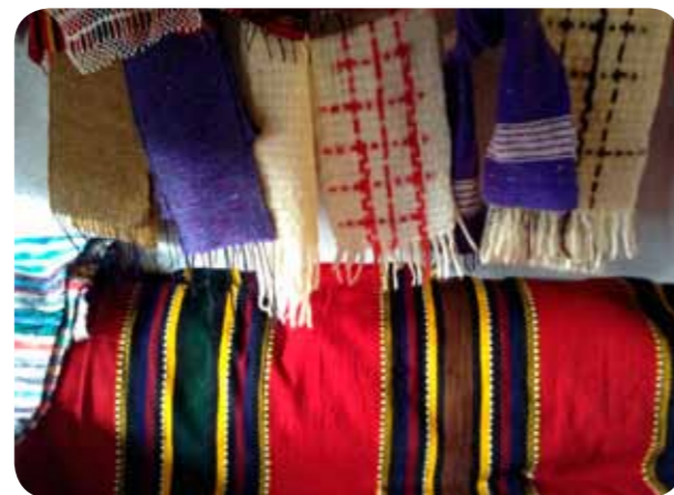
Products of the Serafim Association of Women Weavers, Berovo municipality

The need for a strategic context, through which individual heritage sites might benefit from tourism, was the impulse behind an initiative in Slovenia, which might usefully be studied by Staro Nagoricane Municipality and St. George's Church. This was the creation in the 1990s of the Dolenjska – Bela Krajina Heritage Trail, which embraced over 30 individual heritage sites – each too small to generate a flow of tourists – and created a successful regional tourism product.