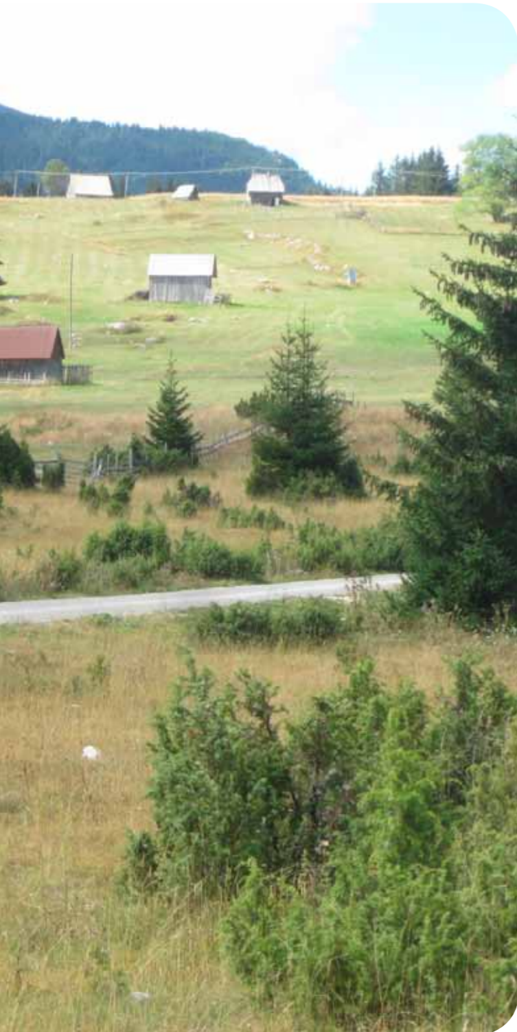
Hill farming landscape near Žabljak, Montenegro

near the capital; and Cetinje, Kolašin and Tomaševo (municipality of Bijelo Polje), more distant from Podgorica. This difference appears to be significant in terms of the ease or difficulty of selling farm products to the urban population. In total, the groups met 14 enterprises, all connected with production of different types of food, including beef, milk, cheese, apples, cornel-berries, mushrooms, herbs, wine, vegetables and honey.