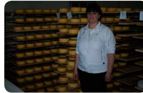
The cheese factory ‘Cevo Katunjanka’ in Danilovgrad