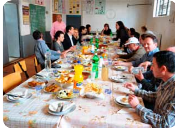
Meeting villagers at Rezanovce School