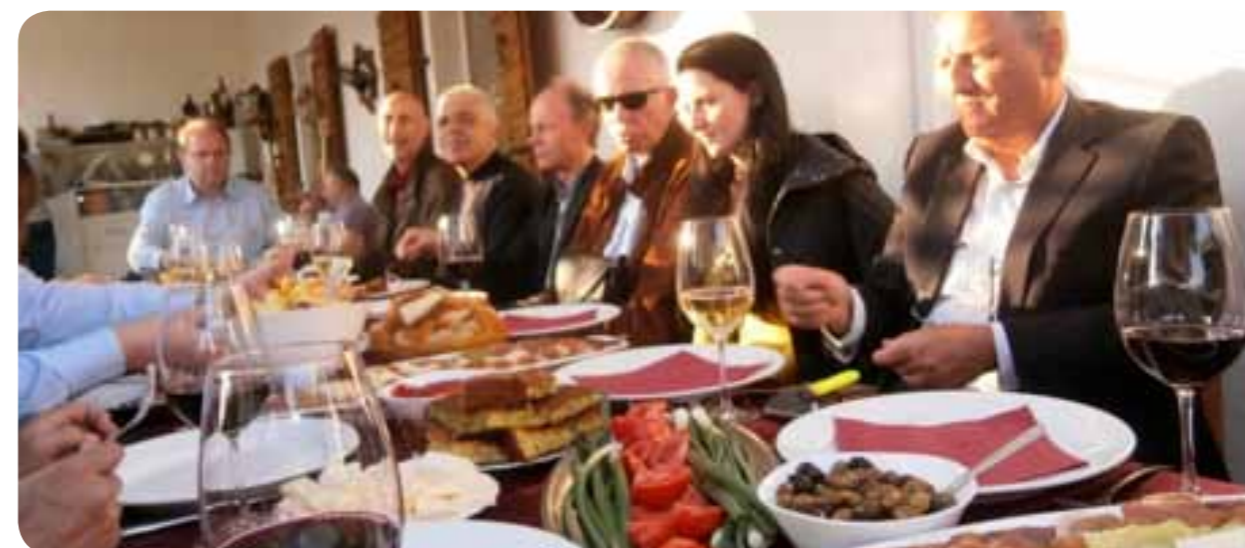
The group enjoys a wealth of local products