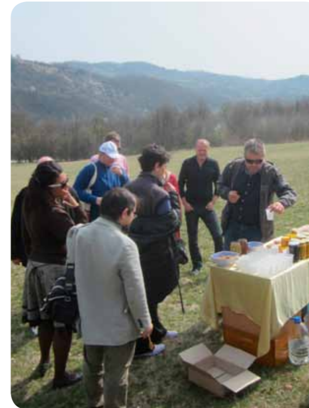
Meeting the President of the Kraljevo Beekeepers' Association