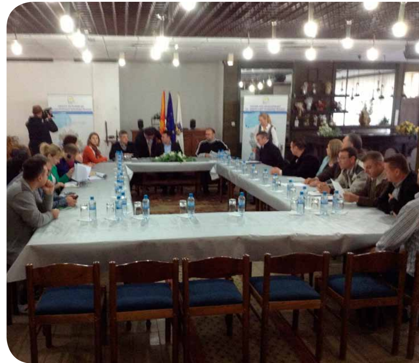
Meeting the Strumica Local Action Group in South-east Planning Region, the former Yugoslav Republic of Macedonia

Moreover, these Rural Development Networks are federated within the Balkan Rural Development Network. They work closely with the Standing Working Group, and thus provide a crucial connection between civil society and governments. They have strong links to the PREPARE Partnership for Rural Europe.