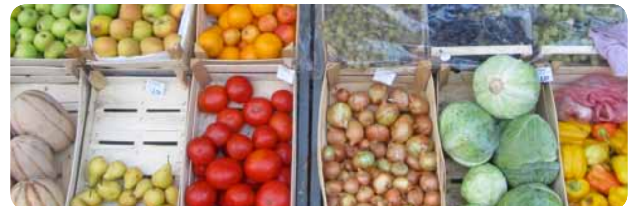
Local products on sale near Mostar, Bosnia and Herzegovina

"With €5 million worth of funding, the multiannual Rural Grant Scheme supports the development and modernisation of three agriculture sub-sectors – dairy, meat, and fruit and vegetable processing. In order to bring Kosovo's agricultural industry up to EU standards, the programme supports a variety of areas. These