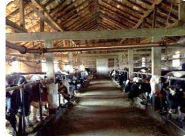
Dairy farm at Staro Nagoricane