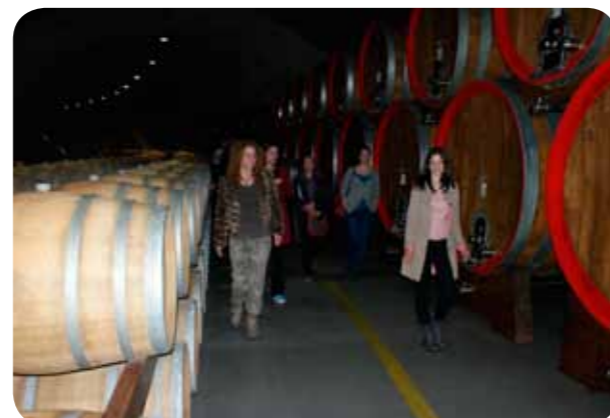
The cellar of wine company ‘JSC Plantaze’, which exports wine to 40 countries

JSC Plantaze. On a very different scale is the wine company ‘JSC Plantaze’, which produces 17 million bottles of wine each year and exports wine to 40 countries. It is the biggest export company in Montenegro, and has won 800 awards at international fairs. It has 700 employees, plus 2000 migrant seasonal workers who harvest grapes from its 2314 ha of vineyard; it also buys grapes from small producers in the region.