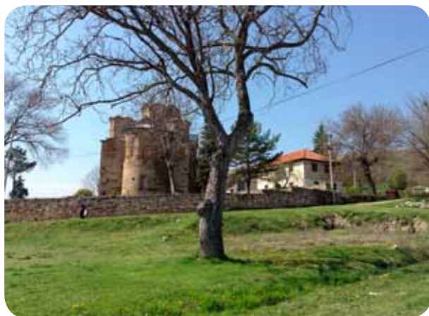
St George's Church, Staro Nagoricane – national heritage site

It comprises a 4-room guesthouse and back-packer accommodation, with home-grown, home-cooked, pick-your-own organic food and drink, and outdoor activities in the adjoining national park. Additional accommodation is sourced in the village when needed. The facilities are self-built, rustic and constantly being improved and extended. The owner seeks to 'think as the visitor does, welcome everyone with a smile and make things clear, simple and practical'. The system is based on no set prices, rules or timetables. He has not sought public subsidies or grants, and never will do so. He attracts visitors from all over the world. The guesthouse is a member of the Slow Food movement, which supports local producers and organics; and has worked with other local producers to sell good food to visitors.