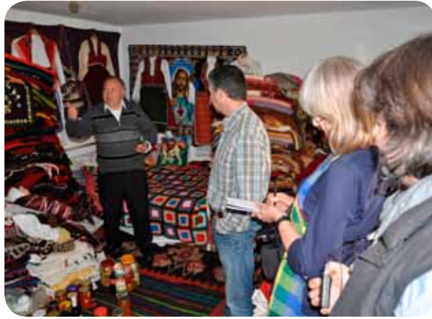
Museum of traditional costumes at Rezanovce