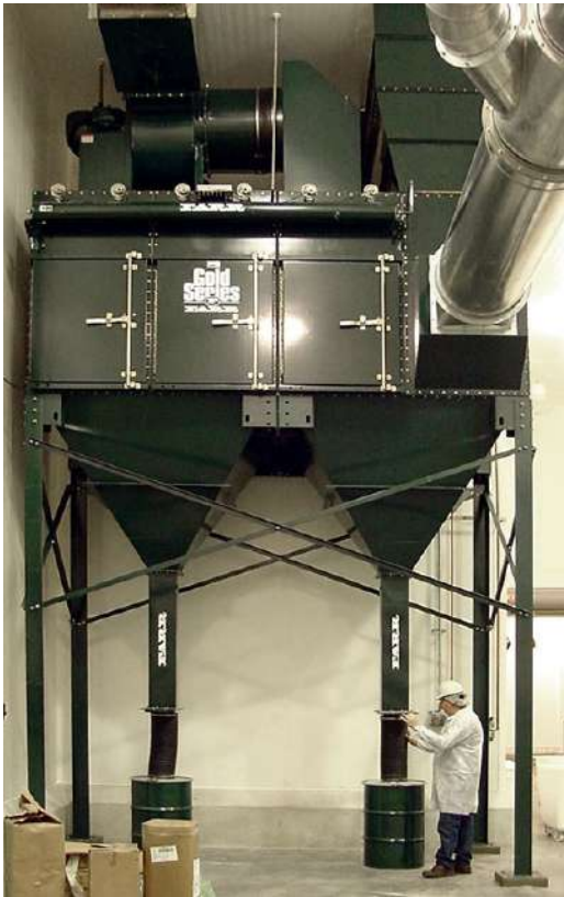
High-efficiency dust collector for dried food ingredients.

There are two basic categories of media commonly used in pleated cartridge filters. The choice is usually driven by dust type, operating temperatures and the level of moisture in the process: