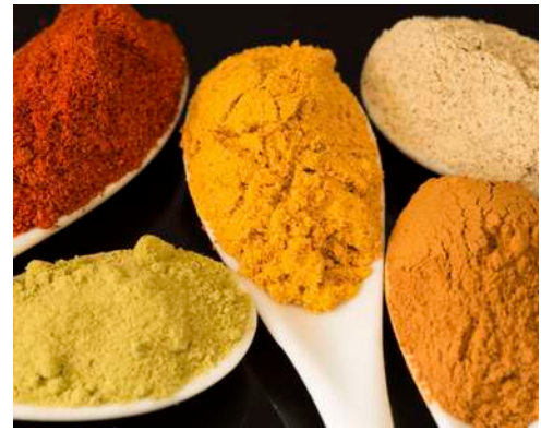
Handling spices and powdered flavoring can produce respirable dust.

Industrial dust collection systems with proper ventilation are acceptable and proven engineering controls to minimize exposure to hazardous flavoring substances and respirable dust. OSHA cautions, however, that food manufacturers should avoid recirculating filtration systems to control flavor vapors because they capture dusts but do not protect workers from vapors. In addition, recirculating filtration systems can spread vapors to other parts of the facility