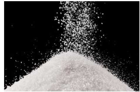
Dust from airborne food particles can lead to cross-contamination.

High-efficiency dust collectors help food manufacturers meet specific food safety hazard and quality controls, limit cross-contamination in production lines and prevent the spread of allergens. They also increase compliance with the FDA's Good Manufacturing Practices (GMPs) and Hazard Analysis and Critical Control Points (HACCPs).