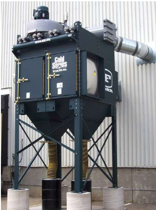
Dust collector at a pastry processing facility.