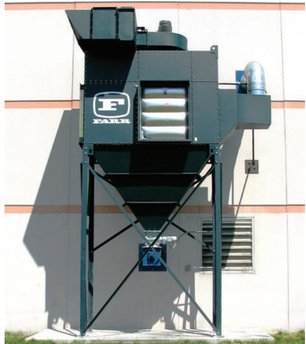
Outdoor dust collector with explosion venting.

In food manufacturing it is critical to know the explosive potential of the dusts, gases and dust/gas mixtures emitted during processing. NFPA states that a hazard analysis is needed to assess risk and determine the required level of fire and explosion protection from combustible dust. The analysis can be conducted internally or by an independent consultant, but either way the authority having jurisdiction will ultimately review and approve the findings.