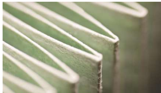
Wide-pleated dust filter media.

of fine dust and prevents the dust from penetrating deeply into the filter's base media. This translates into better dust release during cleaning cycles and lower pressure drop readings through the life of the filter.