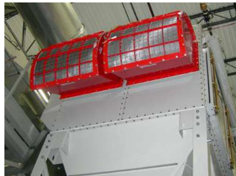
Indoor flameless venting

• Fast acting valve: Designed to close within milliseconds of detecting an explosion, the valve installs in either inlet and/or outlet ducting. It creates a mechanical barrier within the ducting that effectively isolates pressure and flame fronts from either direction, preventing them from propagating further through the process.