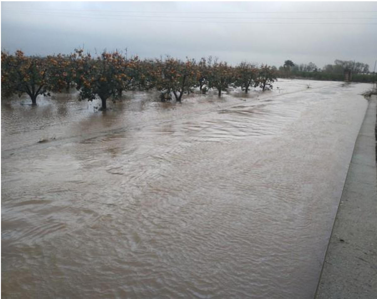
Kakis in Almussafes.

reach the markets. As for kakis, whose harvesting season is underway, there are 4,000 hectares seriously damaged and losses amount to around 12 million Euro. Moreover, 1,000 hectares devoted to seasonal vegetables, both in the open ground and in greenhouses, have been destroyed with an economic impact of 6 million Euro. Lastly, the nurseries of ornamental plants and flowers, which have had 100 hectares hit by the storm, estimate their losses at 4 million, and this follows the impact of COVID-19 on the market.