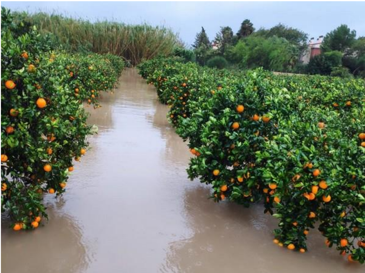
Citrus fruits in La Ribera.

Heavy rains recorded a few days ago in the Spanish Region of Valencia, especially in the coastal regions, have caused more than 62 million Euro in losses, taking into account crop losses, the extra costs of treatments to save the trees and the repairs of damaged infrastructures, according to a first assessment from the Valencian Association of Agricultural Producers (AVA-ASAJA).