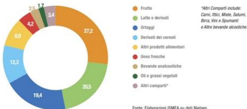
DISTRIBUZIONE DELLA SPESA BIOLOGICA PER COMPARTO ANNO 2020 INCIDENZA %

Fruits, vegetables, milk and organic derivatives are increasingly found on special shelves in supermarkets. This seems to have broken the negative trend of previous years (+3 %).