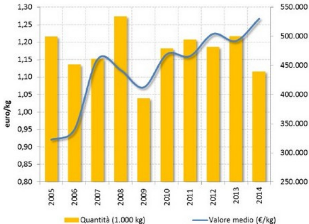
Italian table grape price and export trend. Click here to enlarge (Ismea graph)